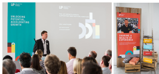
Launch of LEP Growth Service – July 2015