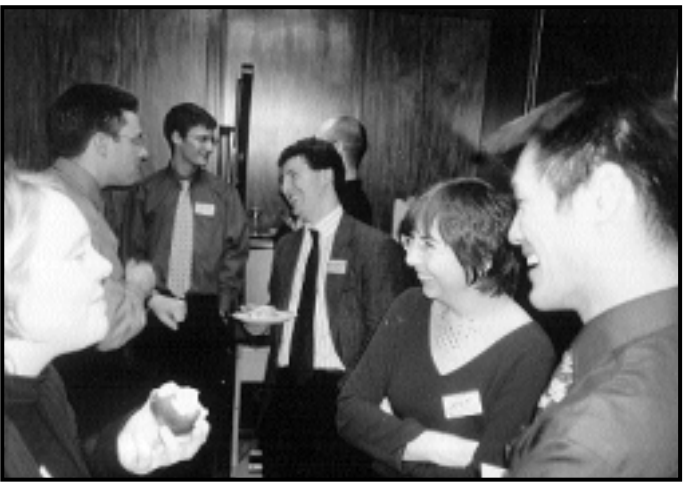
▲ A break in the Foundation's workshop for younger scientists and engineers held in the rooms of the Royal Academy of Engineering on the subject of biodiversity. The workshops have proved to be extremely stimulating and bring views from younger people to the Foundation's evening events.

er in the short-term, with the next election always just around the corner. The UK government has made a modest start on addressing emission targets, but economic instruments such as the climate change levy will inevitably need to play a larger role. Industry's reaction to date does not suggest a mature grasp of environmental or economic fundamentals.