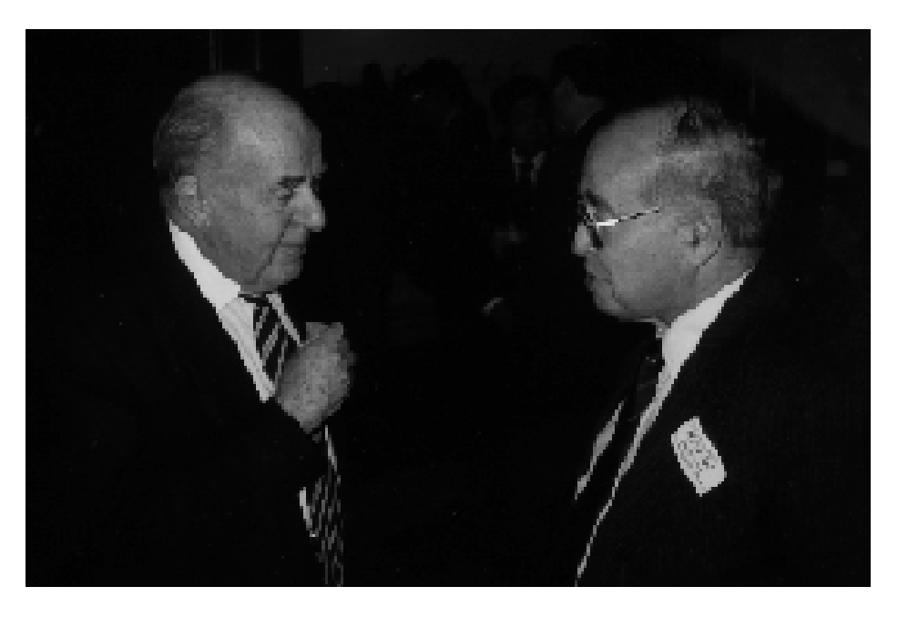
The Foundation's Chairman and the President of the Royal Society at the joint meeting reported on page 20 of this issue