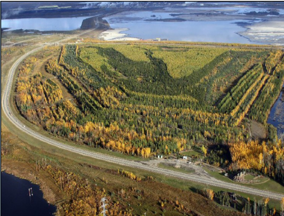
Oil Sands Restoration