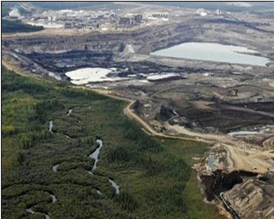
Athabaska Oil Sands, Northern Alberta